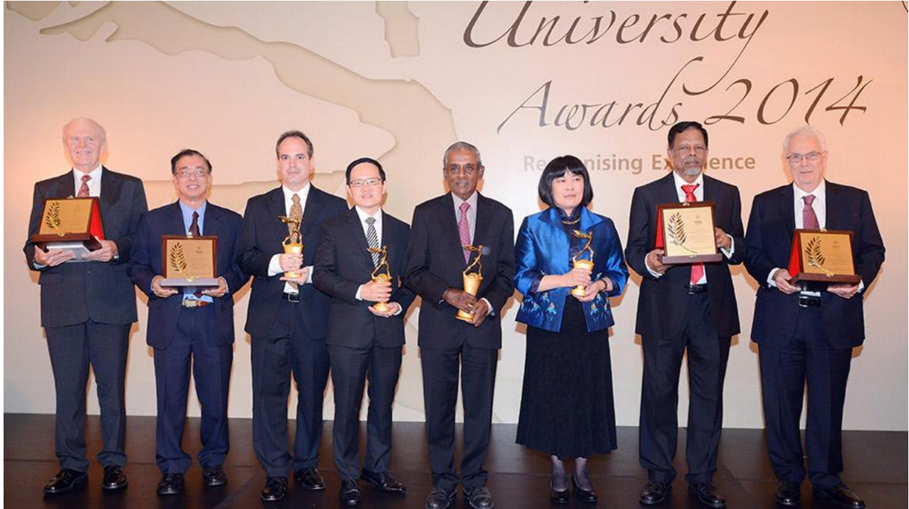
Recipients of the NUS University Awards 2014

NUS honoured nine exceptional educators, researchers and leading professionals at its University Awards 2014 held on 9 May. The annual Awards recognise individuals who have contributed to the University's mission through their notable achievements in education, research and service to Singapore and the community.