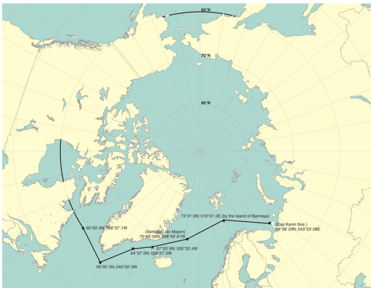
Figure 2 – Maximum extent of Arctic waters application 3