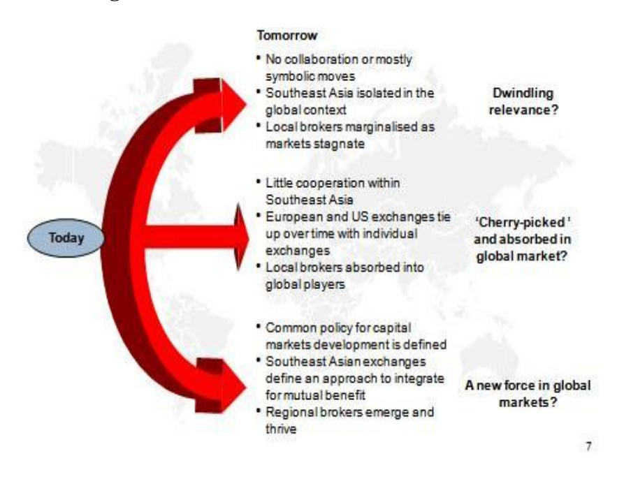
Figure 3: Three Scenarios for Southeast Asia

The threat of domestic exchanges being marginalized or cherry picked by global players in the face of growing competition and consolidation among global exchanges calls for a strengthened strategy for regional collaboration and integration. It also requires that regional integration become a core priority in the national capital market development strategies.